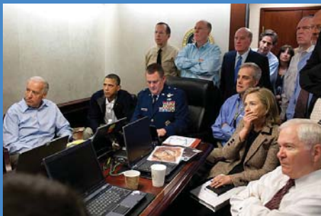
The national security team monitoring the progress of Operation Neptune Spear, the Special Forces mission against Osama bin Laden

Beyond this definition, "targeted killing" is hard to define. Alston argues that the main difference between targeted killing and "extrajudicial execution", "summary execution", and "assassination" is that while "in most circumstances targeted killings violate the right to life, in the exceptional circumstance of armed conflict, they may be legal" – unlike these other terms which "are, by definition, illegal." 53