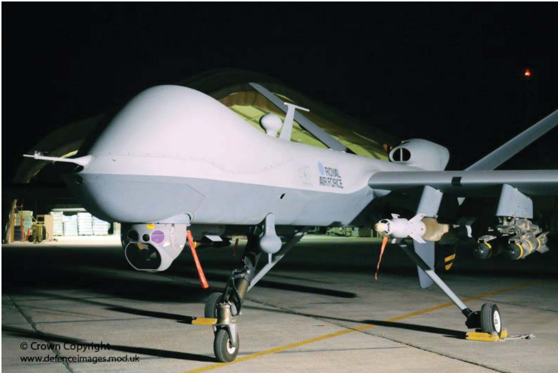
An RAF Reaper drone

Law of War to apply to a use of lethal force outside armed conflict” because it claimed “this is a hypothetical question.” 73