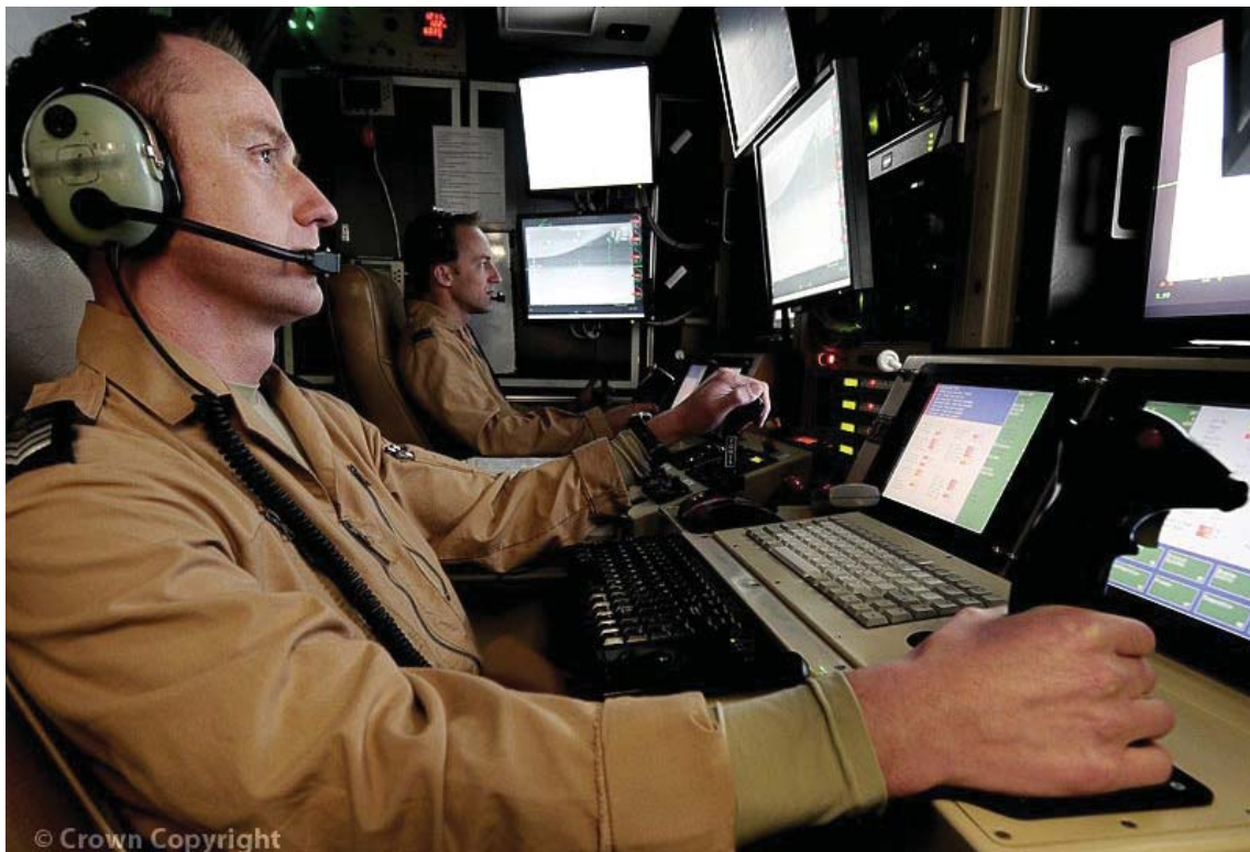
UK drone pilots

The fact that the UK Parliament had no forewarning of the combat role of British embeds caused widespread criticism. John Baron MP, a senior Conservative backbencher, claimed the Government had shown “insensitivity to Parliament’s will” by not taking the issue to vote in the House of Commons. 271