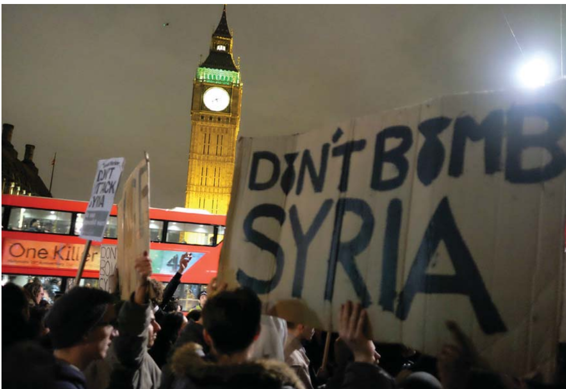
Protestors outside Westminster on the day of the parliamentary vote authorising strikes in Syria

The 2010 SDSR made this point very clear, speaking of the need to “win the battle for information, as well as the battle on the ground” and acknowledging that “a more transparent society” aided by “the speed and range of modern global communications” would submit British operations to intense scrutiny. 34