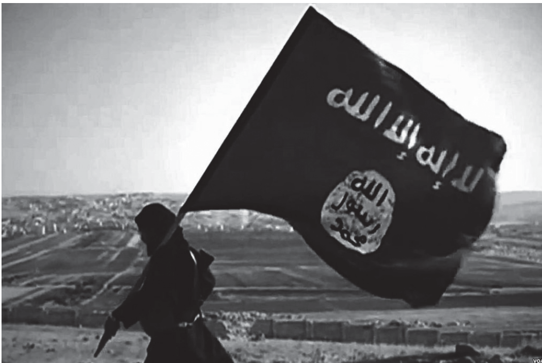
ISIS Fighter

In evidence given to a 2016 Joint Committee on Human Rights (JCHR) investigation, UK government testimony confirmed that Britain is “not in a generalised state of conflict with ISIL, except in Iraq and Syria.” 14 Nevertheless, mapping reports of UK military