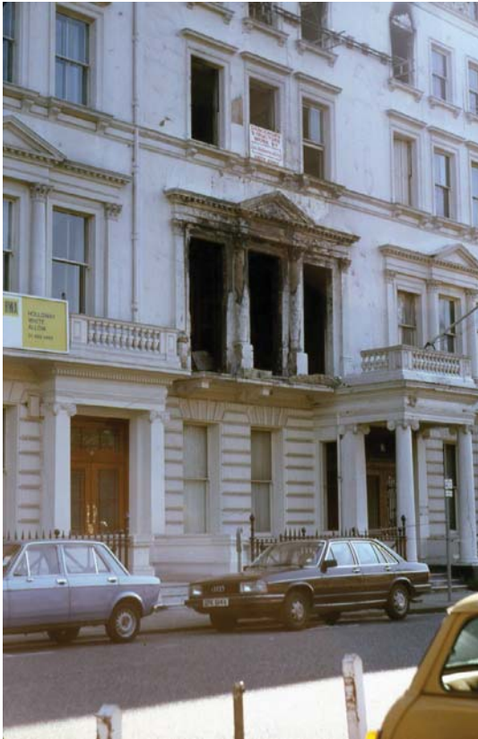
Iranian Embassy after SAS raid