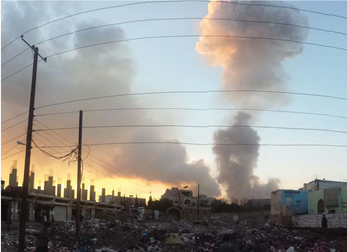
Airstrikes in Sana'a

law, but that is not about this military operation—that is in general for the royal Saudi air force.” 317