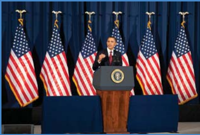
Obama at the National Defense University, Washington DC, outlining the US policy of targeted killing

In addition, the US government has explained the process by which these individuals are targeted and then the way these decisions are overseen. For example, the Presidential Policy Guidance confirms that “operating agencies”, such as the CIA and Defense Department, can formally nominate an individual to be targeted. 109 They must then submit plans to the National Security Staff (NSS) and lawyers across different security agencies.