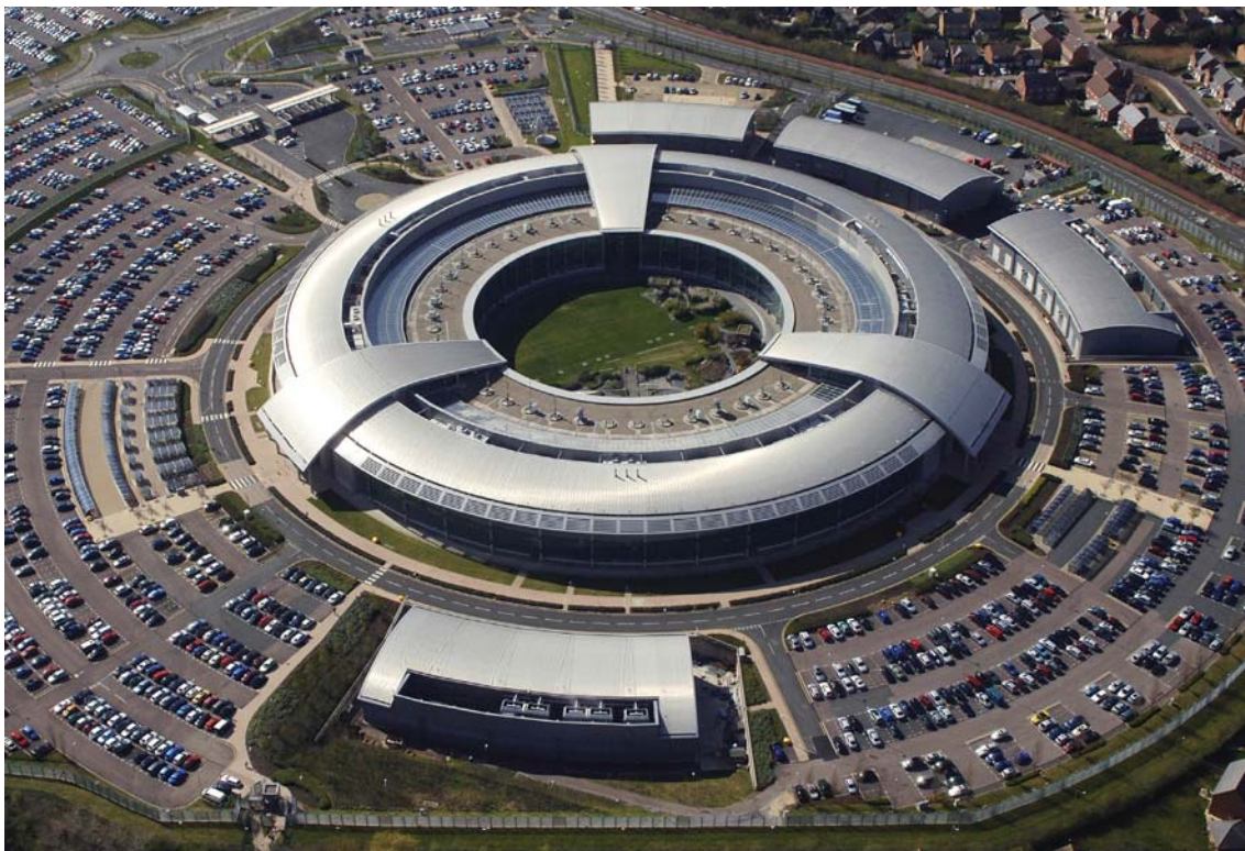
“The Doughnut”, the headquarters of the GCHQ

While sharing capabilities with allies is a necessary and desirable part of UK defence and security policy, a number of cases have revealed that there are problems with the low levels of transparency and accountability that currently accompany these activities when the UK is providing capabilities to partners who are involved in conflict. The fact that the UK was providing capabilities rather than directly engaging (as well as the fact that some of these activities were provided through the intelligence services) has allowed the government to be involved (and in some cases deeply involved) in overseas conflicts with minimal scrutiny – and in some cases completely denying its involvement.