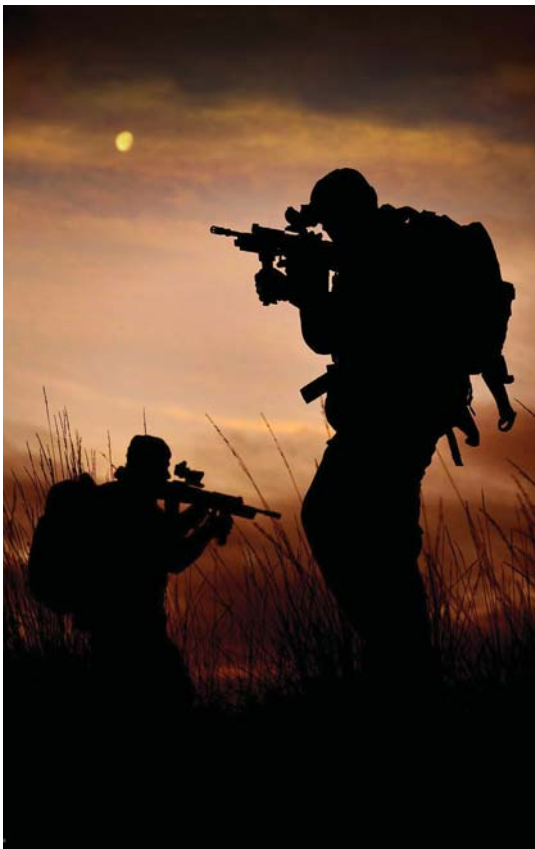
US investment in their Special Forces has dramatically increased

In February 2016 , UKSF were reported to be working alongside their counterparts in the city of Misrata, 149 as other claims began to surface that UKSF were escorting MI6 teams to meet officials to discuss supplying weapons and training to the regime's army and militias. 150